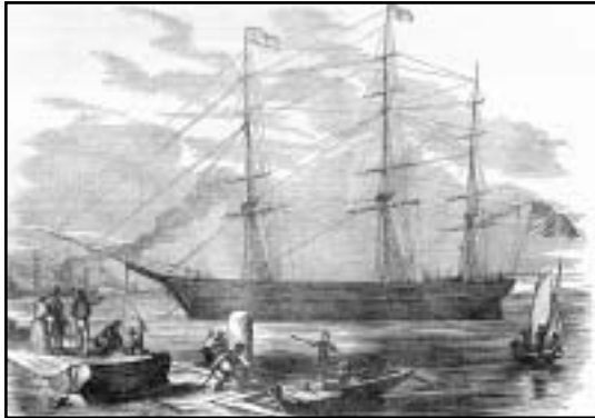
Witch of the Wave, Gleason's Pictorial Drawing-Room Companion, June 14, 1851

Each of the 40 or so models in the Athenæum collection reflects the history of one or more great merchant sailing vessels. Many are documented in publications owned by the Athenæum with brief histories of their travels, their crews and their functions, reflecting varying degrees of success at sea. Destructive events such as fire or sinking are noted, as are sales that take the ship out of U.S. ownership. A large number in the Athenæum collection came to us from the Gray and Prime Coal and Salt Co. collection. This company occupied the premises earlier occupied by E.F. Sise and Co., a mercantile company that may have owned these models originally.