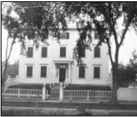
The Rundlet-May House

The Athenæum's next exhibit, The Preservation Movement Then and Now , opening February 3, tells the story of the preservation movement in New England which began with the fight to save the Hancock House in 1863.