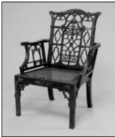
Armchair, probably London, 1763-67 Moffatt-Ladd House Collection

The very popular exhibit, Women of the Moffatt-Ladd House , is being held over in the Randall Gallery for